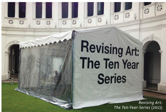
Revising Art: The Ten-Year-Series (2013)