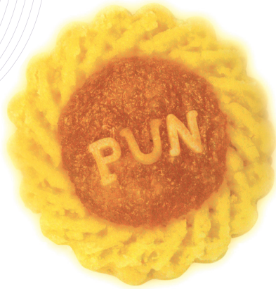
Eat Your Pun Tarts (2007)

It has to be Death of an Artist —produced and performed at Substation in 2011. It was an opportunity for me to express the contemporary state of the artist. All the essences and efforts of one's work are either murdered or killed softly by money and vanity—these, to me, are the biggest challenges everyone faces as an artist. The artwork expresses these concerns. I was absent throughout the duration of the exhibition declaring myself dead. The installation with a durational performance comprised three framed and photocopied death certificates (of my late father, my late grandmother and myself), a stack of photocopied certificates based on the framed ones and a lady in black whom I had commissioned to cry for an hour. This was not only to lament the cause of death due to worldly gains, it was also a part of my study to question the image of the artist as a symbol of vanity.