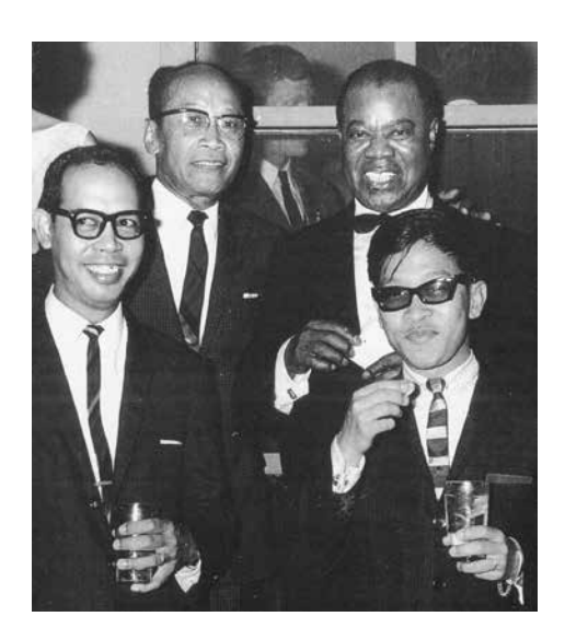
The Soliano Clan with Louis Armstrong, United States Embassy in Singapore, 1964.

"Musicians don't retire. They stop when there is no more music in them."