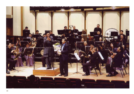
At the Singapore International Competition for Chinese Orchestral Composition, Concert for Award-winning Compositions organised by the Singapore Chinese Orchestra, 2006