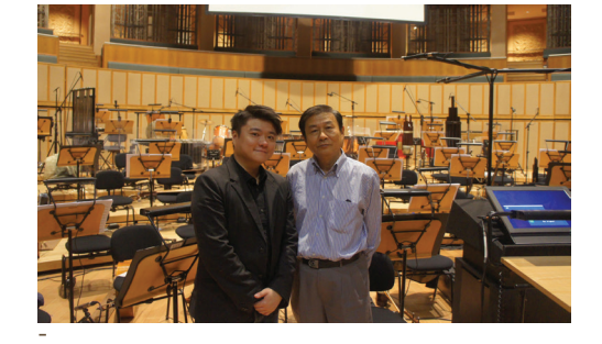
At the rehearsal for 'Ruan Lingyu's The Goddess - A Silent Film Concert', Huayi Festival, 2014