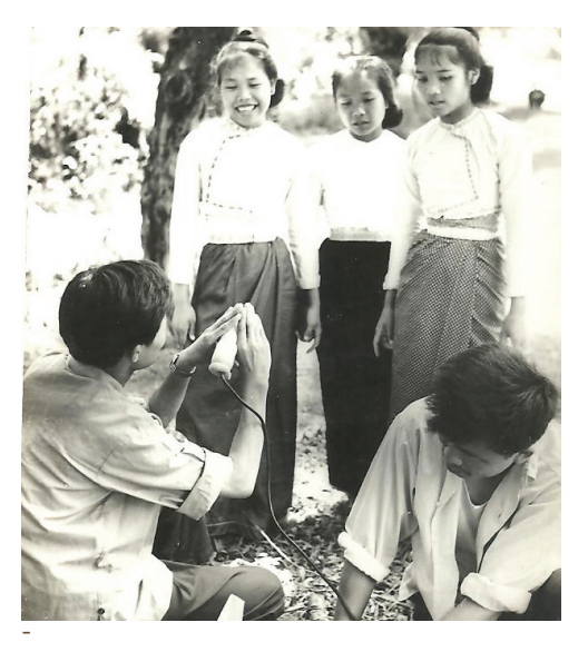
Researching on Yunnan folk songs while working at the China Central Newsreel and Documentary Film Studio, Beijing, 1978