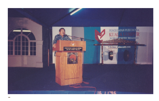
World Poetry Reading, Kuala Lumpur, 1996