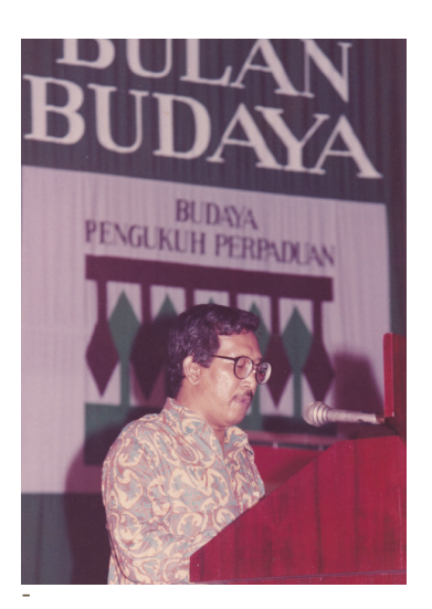
Poetry Reading at Bulan Budaya, Malay Village, 2002