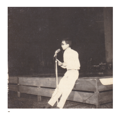
Poetry Reading at Anak Alam, Jalan Ampang, Kuala Lumpur, 1972

Djamal has been an important critic, promoter and mentor of Malay theatre in Singapore since the 1980s.