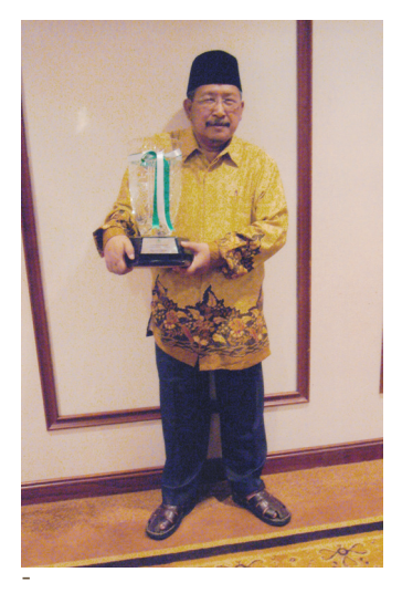
Receiving the Anugerah Tun Seri Lanang (Tun Seri Lanang Award) conferred by the Malay Language Council, Singapore, 2007