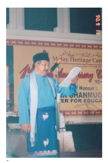
Poetry Reading, Malay Heritage Centre, 2007