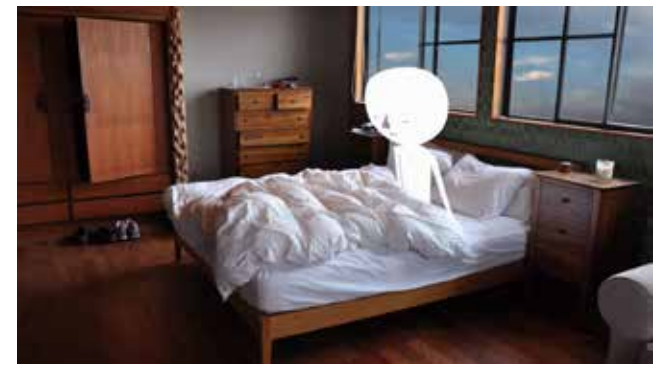
'The Great Escape', film still, 2015.