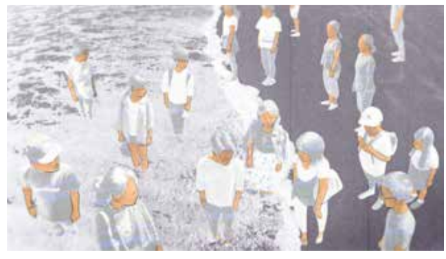
'Between Us Two', film still, 2017. Photo courtesy of Tan Wei Keong

"Animation is an amazing medium to tap into the bizarre unconsciousness, and I enjoy writing stories about characters with complex personalities. I like the act of manipulating narratives and exploring history and time."