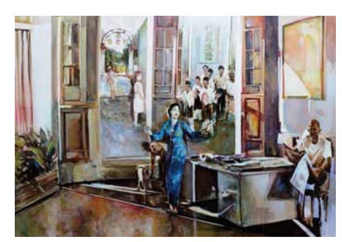
'Great World City 村民生活', oil on canvas, 2015.