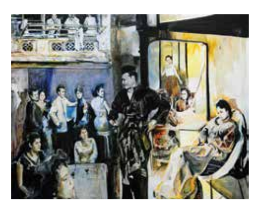
'Bangsawan', part of 'Dusk to Dawn | Fajar ke Senja' solo exhibition, oil on canvas, 2014.