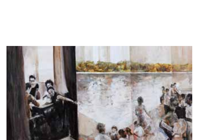
'The Glass Divider', part of 'A Reading Session' exhibition, oil on canvas, 2015.