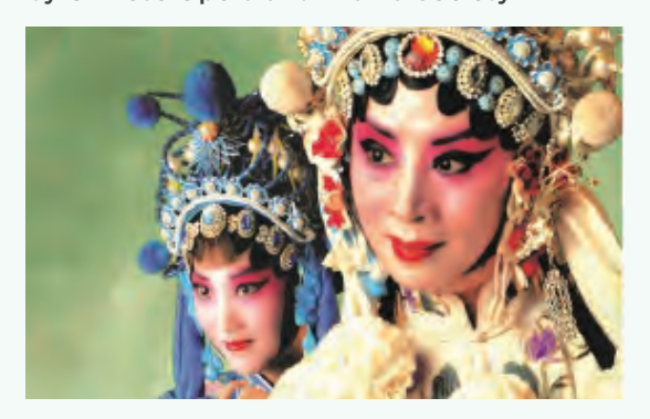
This programme is in Mandarin.