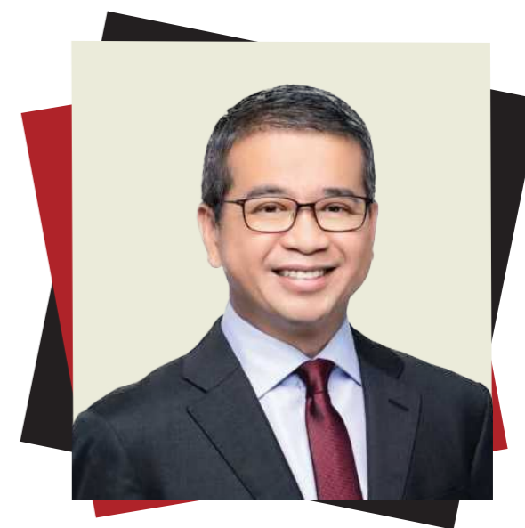
Edwin Tong Minister for Culture, Community and Youth & Second Minister for Law

Building on the consultative approach that NAC has taken to develop the plan, we now call on all stakeholders to participate in the creation of a dynamic and flourishing arts scene. Together, I am confident that we can leverage the power of the arts to create a connected society, make a distinctive city we are proud to call our home and fulfil the diverse aspirations of Singaporeans.