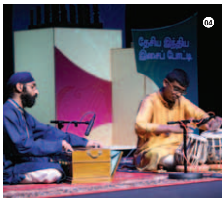
01 Arts on the Move, Singapore Arts Festival. 02 South-West District Arts Festival. 03 NAC and the Arts Council Korea signed a Memorandum of Understanding. 04 The 2008 National Indian Music Competition.