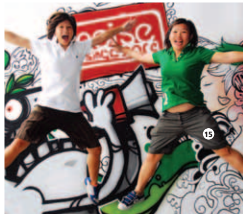
12 La Guardia Flamenca, Arts Where We Eat. 13 The second series of Traditional Malay Music Workshops – Modern Ethnic Music Workshop and Concert. 14 The Arts Community Tours – Community-Sing-Along. 15 Noise Singapore's launch at Suntec City.